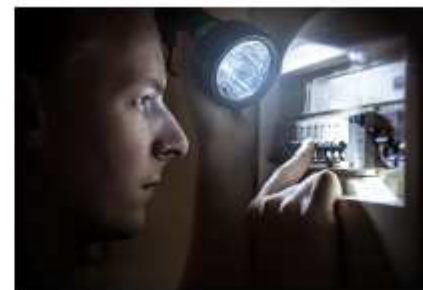
Report and prevent